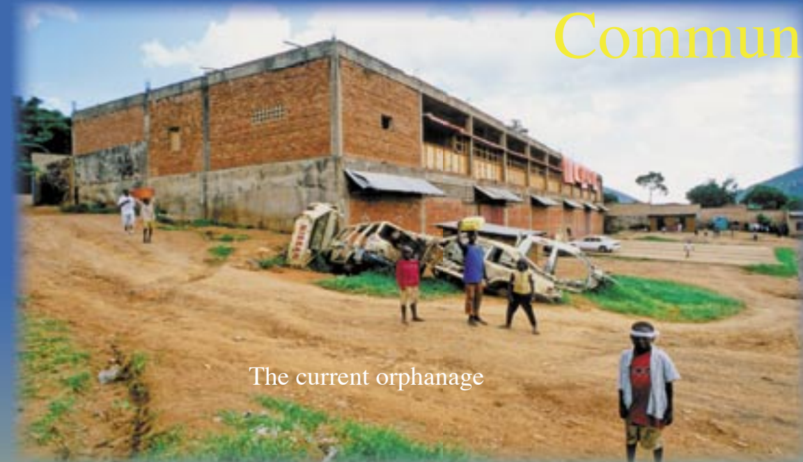
The current orphanage